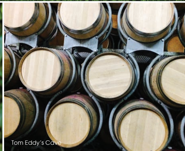
Tom Eddy's Cave