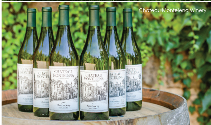
Chateau Montelena Winery